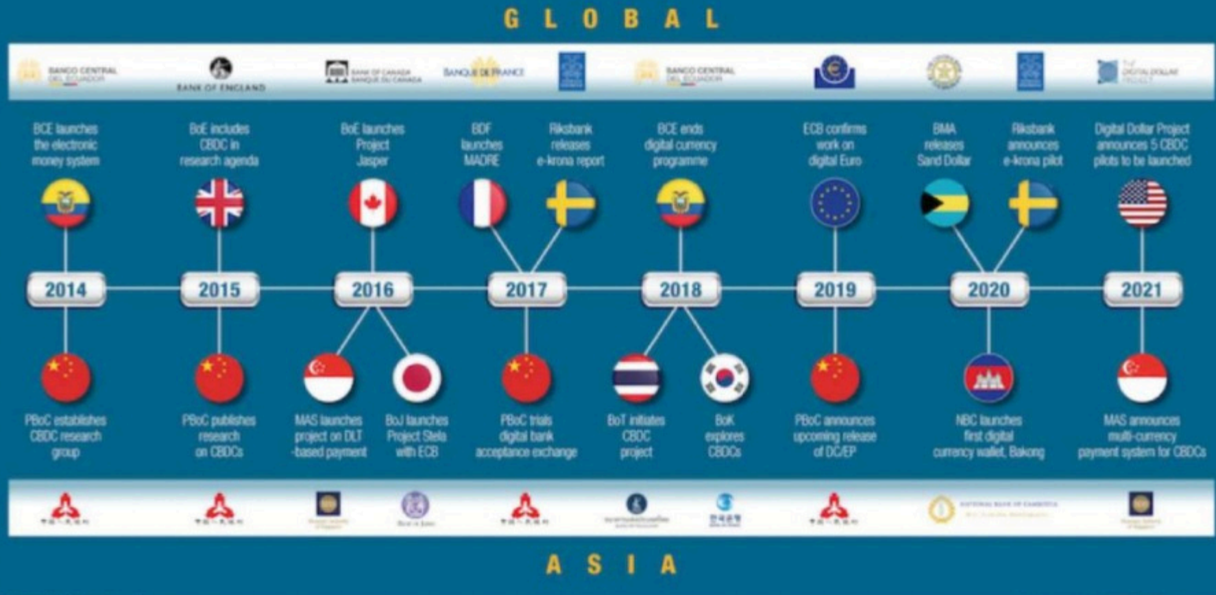
Fig 1.0 - Bahamas becomes the first country to officially launch a CBDC